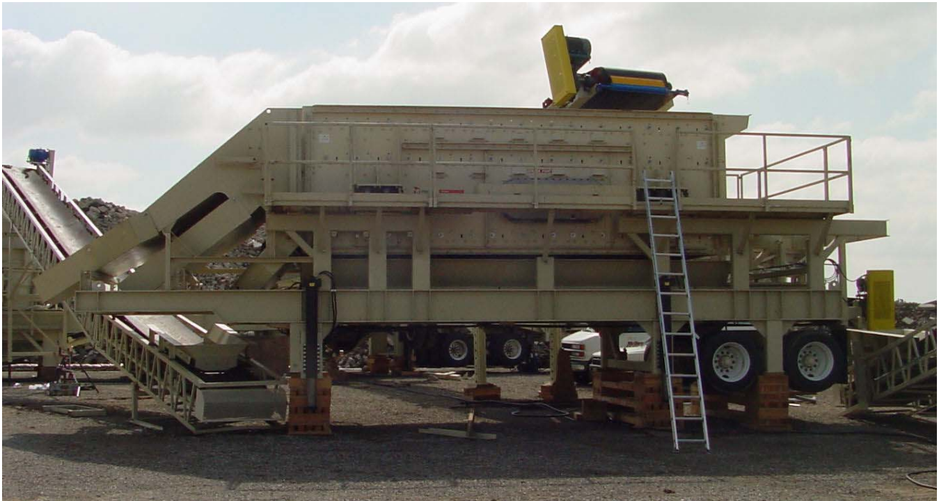
Metso Minerals 8' x 20' triple deck screen, driven by a 75 HP motor.