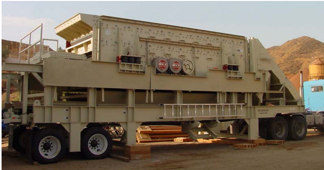
Shown are the folding side catwalks for transportation.